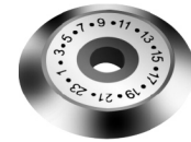
96° hardness blade and 24 positions Best cutting performance